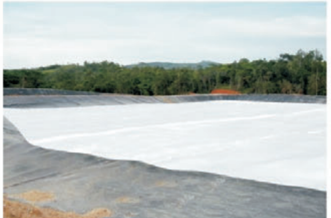
Malutu Sanitary Landfill, PT. Putra Gunung Jambu, South Kalimantan, 2010