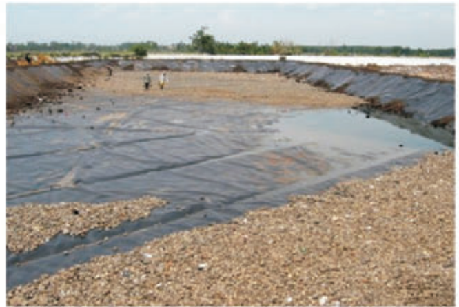
Probolinggo Sanitary Landfill, PT. Kharisma Multi Jaya, East Java, 2008