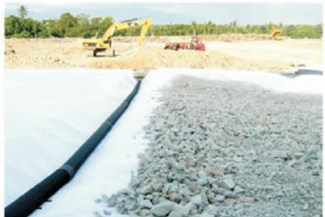
Gapuk Sanitary Landfill, PT. Waskita Karya (Persero), West Nusa Tenggara, 2009