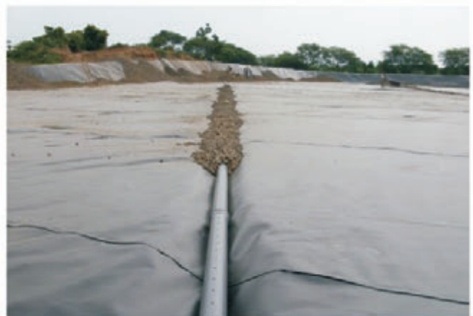
Situbondo Sanitary Landfill, PT. Cipta Aneka Solusi, East Java, 2008