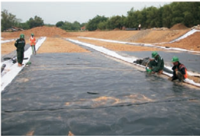
Sumurbatu Sanitary Landfill, PT. Godang tua Jaya, West Java, 2010