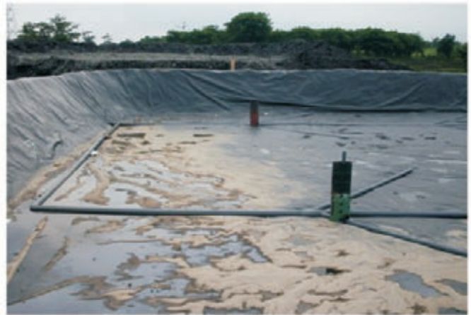
Pasuruan Sanitary Landfill, PT. Kharisma Multi Jaya, East Java, 2008