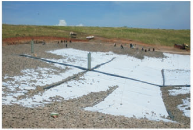
Maumere Sanitary Landfill, PT. Ardi Tekindo Perkasa, East Nusa Tenggara, 2010