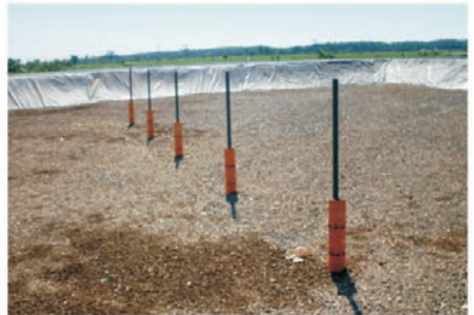
Probolinggo Sanitary Landfill, PT. Saburnaya, East Java, 2009