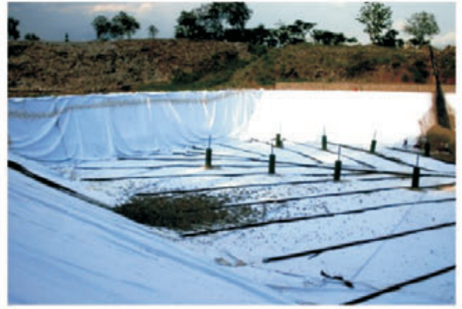
Tulungagung Sanitary Landfill, PT. Kharisma Multi Jaya, East Java, 2009