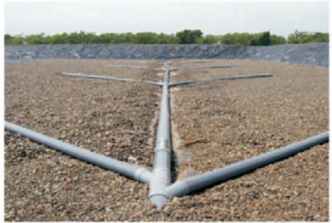
Pasuruan Sanitary Landfill, PT. Indopenta Bumi Permai, East Java, 2008