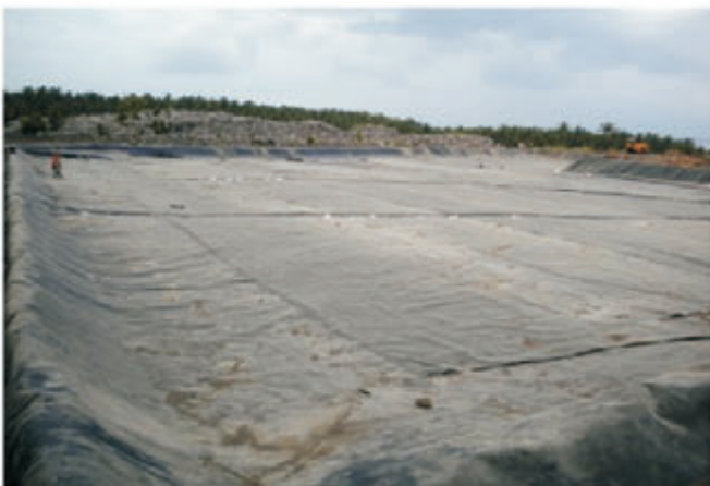
Ijobalit Sanitary Landfill, PT. Bukidalam Barisani, West Nusa Tenggara, 2010