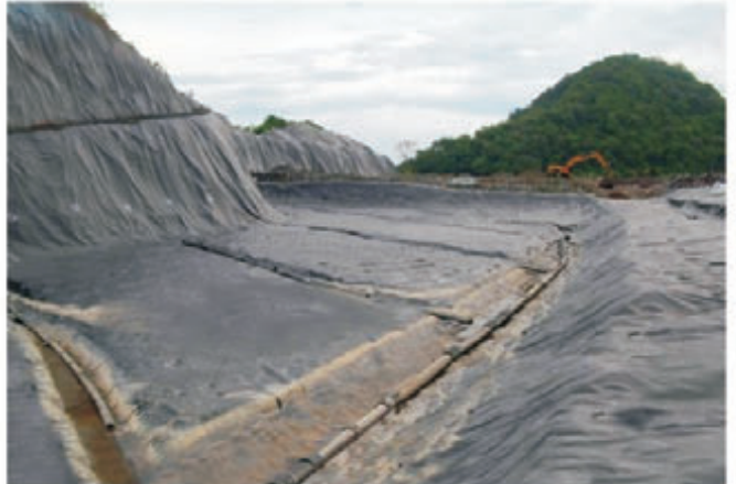
Gapuk Sanitary Landfill, PT. Godhar Utama Kharisma, West Nusa Tenggara, 2010