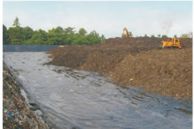
Gapuk Sanitary Landfill, PT. Waskita Karya (Persero), West Nusa Tenggara, 2008