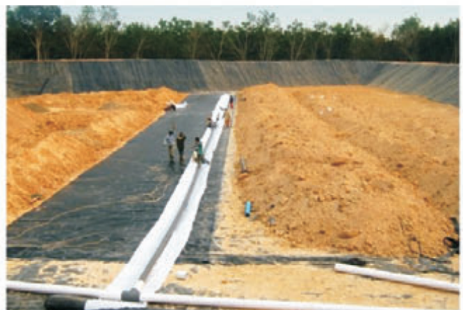
Telang Sanitary Landfill, PT. Saka Buana Yasa Selaras, South Kalimantan, 2009