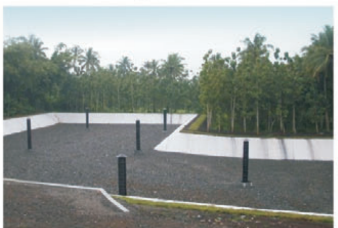
Magelang Sanitary Landfill, PT. Bumi Mas Perdana, Central Java, 2010