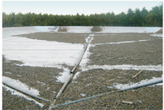
Ijobalit Sanitary Landfill, PT. Bukidalam Barisani, West Nusa Tenggara, 2009