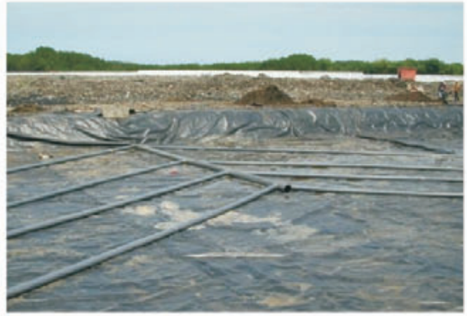
Probolinggo Sanitary Landfill, PT. Indopenta Bumi Permai, East Java, 2007