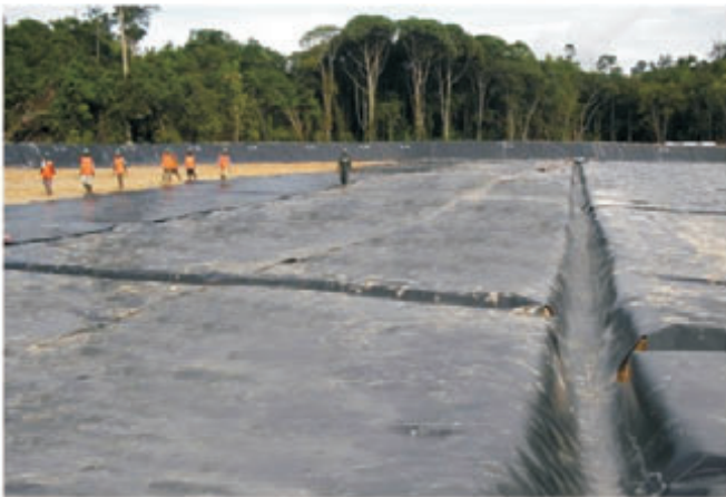
Penajam Sanitary Landfill, PT. Nanda Prima, East Kalimantan, 2010