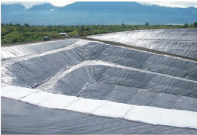
Palu Sanitary Landfill, PT. Tunas Tehnik Sejati, Central Sulawesi, 2010