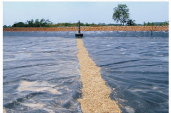
Kota Metro Sanitary Landfill, PT. Hakima Inti Perkasa, Lampung, 2009