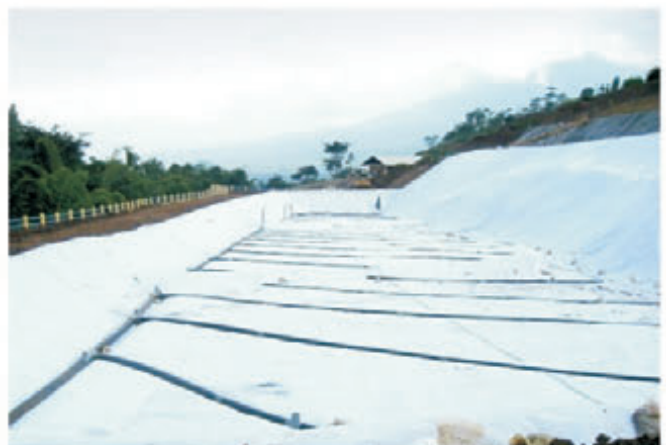
Batu Sanitary Landfill, PT. Triperkasa Aminindah, East Java, 2008