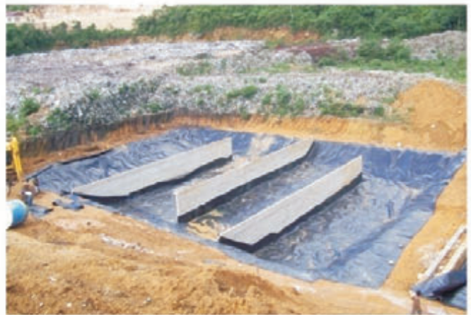
Ambon Sanitary Landfill, PT. Sinar Perdana Mandiri, Maluku, 2008