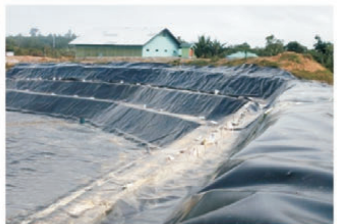
Grogot Sanitary Landfill, PT. Mitra Alya Abadi, East Kalimantan, 2009